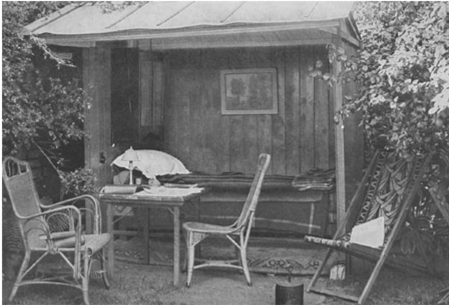
GARDEN ADOBE Floor 85x50 inches; backwall 35x75 inches; side-wall, front=height 85 inches; canopy height 15 inches; jutting out 36 inches. Built by the author himself. - Should be used summer and winter, especially by all the weak-chested and consumptive with access to a garden.

Through sleeping out of doors I was able to enjoy a night temperature at least 20°F. (10°C.) below the temperature of my old bedroom indoors, so that moving into my garden was almost equal to spending my nights in the Alps. Just think of the total increase in the oxygen inhaled which, for three or four of the hottest months of the year, must make a considerable difference to health and well-being. To this must be added the benefit derived from the moist night air of a garden covered with grass and full of trees and shrubs. The moisture of the air is of great importance to the organs of breathing, especially during a heat-wave.